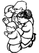
Please Pray For:

† Thanks for the assurance that God is in control no matter what happens in our daily lives.