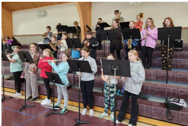
The St. James band led the students in our school song at Thursday's pep fest for our 5-6 boys basketball team.

Sun., Dec. 8 Second Sunday in Advent 10:30 a.m. Kindergarten Choir Mon., Dec. 9 3:00-4:45 p.m. BB practice Wed., Dec. 11 8:20 a.m. Advent Chapel 4:00 p.m. BB game at Cologne Academy 7:00 p.m. Advent Worship Thurs., Dec. 12 Library 4:00 p.m. Home BB game vs. Waconia Sun., Dec. 15 Third Sunday in Advent Mon., Dec. 16 4:00 p.m. Home BB game vs. Wayzata Wed., Dec. 18 8:20 a.m. Advent Chapel 7:00 p.m. Advent Worship Thurs., Dec. 19 Library 6:30 p.m. P-8 Christmas program Fri., Dec. 20 10:00 a.m. P-8 Christmas program Dec. 21-Jan. 3 Christmas Break Mon., Jan. 6 Classes resume